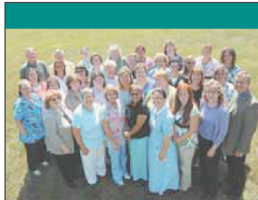
Special thanks from the staff at Kosciusko Home Care & Hospice, Inc.

"Cry Uncle, Sumbody" hits the bookstores and Amazon on April 12, which appropriately marks the sesquicentennial of the American Civil War. More information about the author can be found at: www.simplelling.net